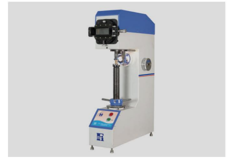
Hardness Testing Machine